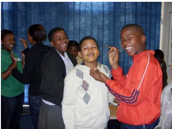
Learners from the Eastern Cape participating in a meaningful participation exercise.

Social Change Communication also makes strategic use of advocacy, communication and social mobilisation to systematically facilitate and accelerate change in the underlying drivers of HIV risk, vulnerability and impact.