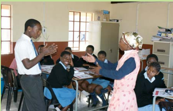
As part of the Schools Programme, learners can choose to use drama to share 'lessons learnt' with their peers.